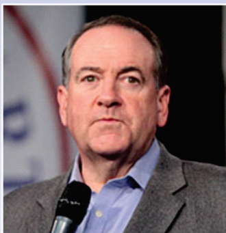
Governor Mike Huckabee